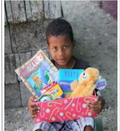
Christmas in Nicaragua!